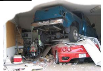
...some guy's garage...